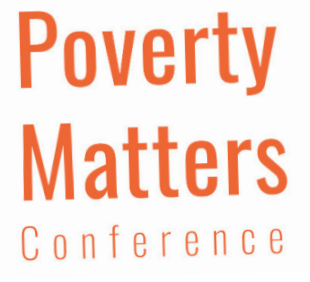
Exhibit at the Annual Conference or Poverty Matters Conference

Connect with over 200 social service professionals Table and chair Power available by request One free registrations ($250 value)