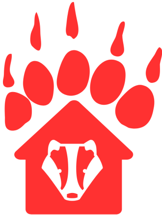
BADGER STATE HOUSING ALLIANCE

WAHAN is no longer viva la Badger State Housing Alliance (BSHA, which is kinda fun to say!) We will be announcing our new name at the A Home for Everyone Conference.