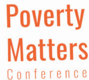
Exhibit at the Annual Conference or Poverty Matters Conference

Connect with over 200 social service professionals